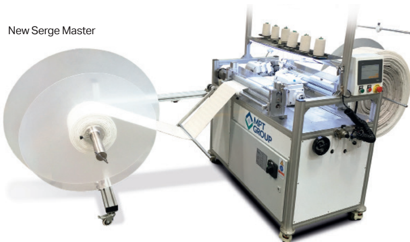
New Serge Master