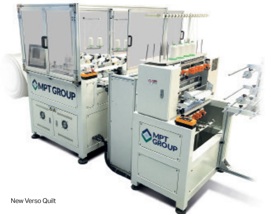
New Verso Quilt