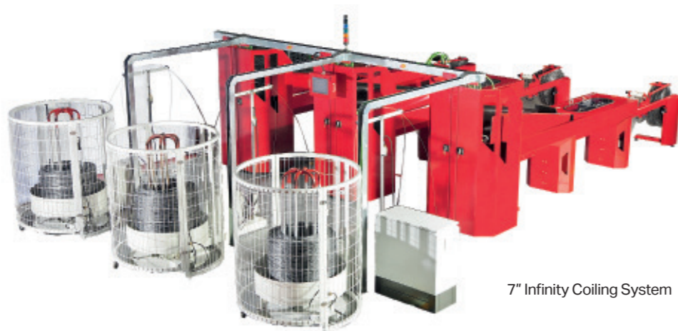
7” Infinity Coiling System

THE COMPANY HAS ALREADY INITIATED PLANS TO HANDLE THE INCREASED PRODUCTION CAPACITY WITH RESTRUCTURING OF ITS BACUP PRODUCTION FACILITY AND EXPANDING ITS MANAGEMENT AND TEAM.