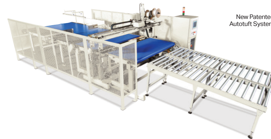
New Patented Autotuft System

The UK-based firm, which is centrally located for 70% of UK manufacturers, expects to see a significant jump in its 2018/19 turnover in the year ahead to £5.9 million. The company has already initiated plans to handle the increased production capacity with restructuring of its Bacup production facility and expanding its management and team. The business has so far proven to the industry of mattress manufacturing just what is possible with the correct tools and an expert team in place. For example, MPT’s automatic mattress tufting system, the