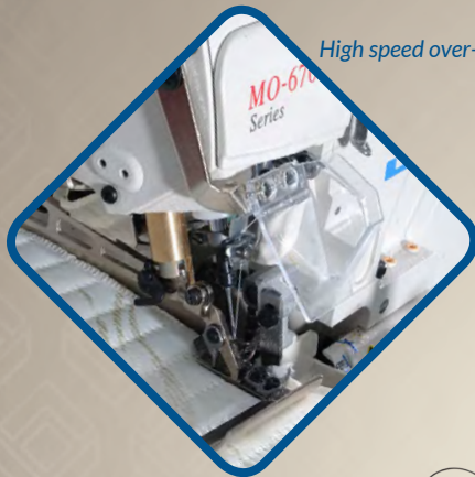
High speed over-lock heads

The BordaSerge is an automatic system for serging both sides of any quilted or pre-stitched border up to 500mm in width. The finished border is collected on the variable speed rewind unit. Capable of serging 80 feet per minute. The BordaSerge is without doubt one of the fastest machines available.