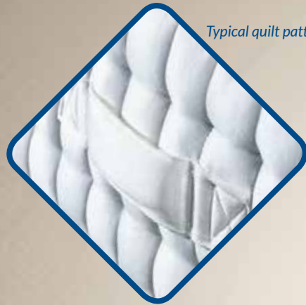
Typical quilt pattern detail

The BordaTac S2 side stitching machine is a simulated side stitching machine offering the very best hand stitched border effect on the market today. BordaTac S2 will also offer increased border widths up to 17" a remarkable 4" wider than current available technology offers.